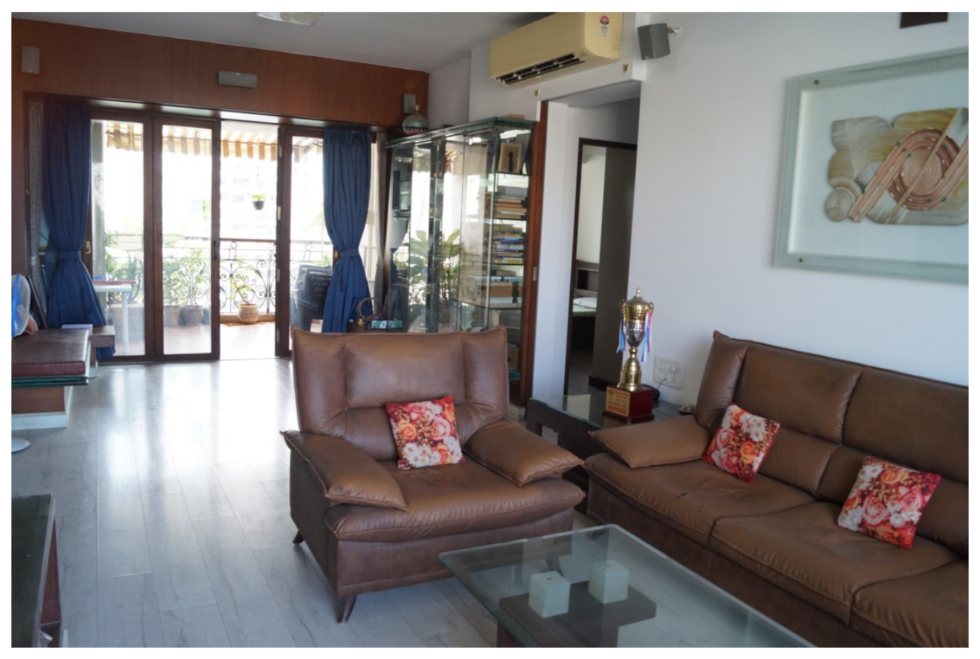
Library With Balcony

+91.9820184758 | info@gladeeagency.com | www.gladeeagency.com | RERA Reg. No. : A51900046267