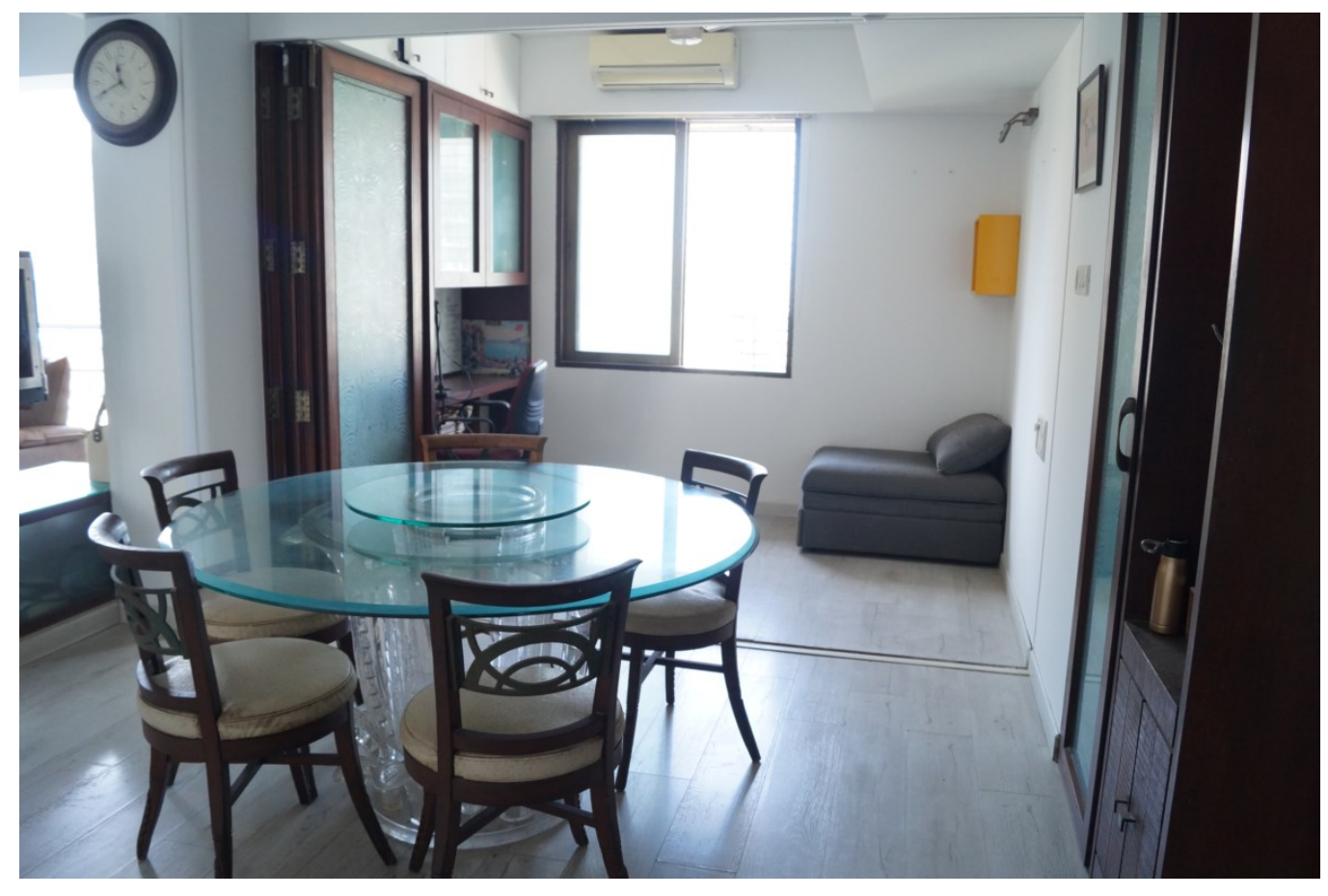
Dining + Study Area

+91.9820184758 | info@gladeeagency.com | www.gladeeagency.com | RERA Reg. No. : A51900046267